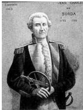
Jean-Charles de Borda (1733 -1799)