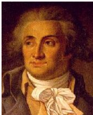
Marquis de Condorcet (1743 - 1794)